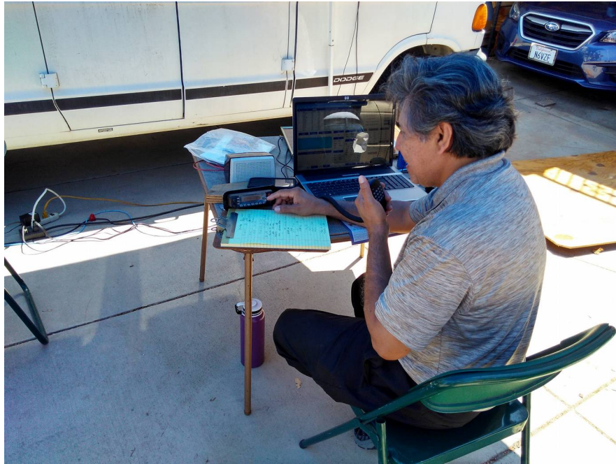
New Technician - 1st Time on the Air (Maybe we should've had a GOTA Station)