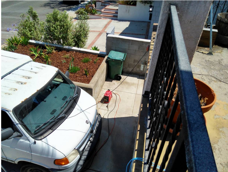
100% Emergency Power