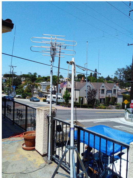
2m and 20m Antennas in Non-Permanent Location (Also 40m on van's trailer hitch)