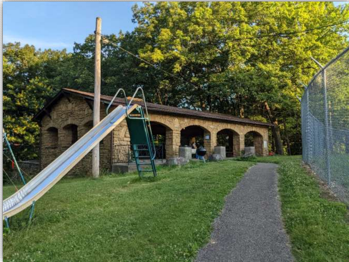
Horns Hill Park, Newark, Ohio