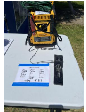
We had many young future Hams try our Educational Station to send Morris code with the key and tone amplifier to spell their first name and also send a SOS.