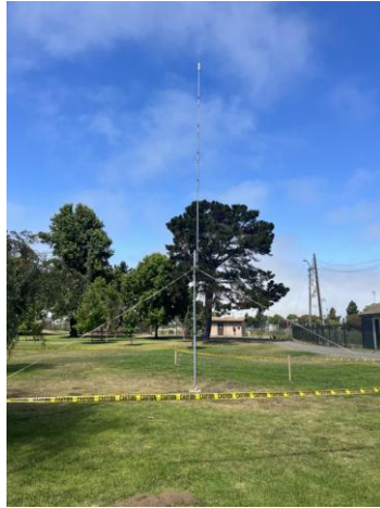
Hustler 10m to 80m Vertical Trap Ground plane with 3 sets of radials on each band tied to the guy ropes.