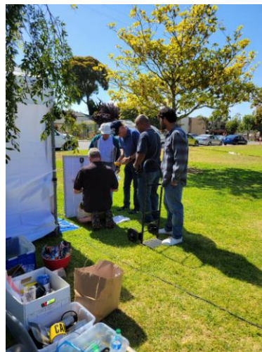
CCARG members working on the solar panel.