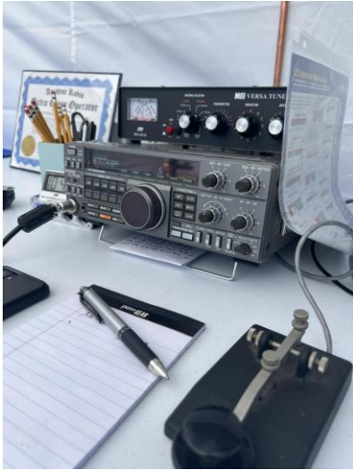
CW Station operating at 100 watts from 100% Solar power on 10m to 80m.