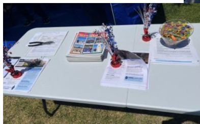
Our Table with the Visitors Log Sign in, and ARRL Handouts: What is Field Day, What is ARRL, and how to join. We also had the Activity Guide hand outs from the City of Arroyo Grande Recreation and Parks.