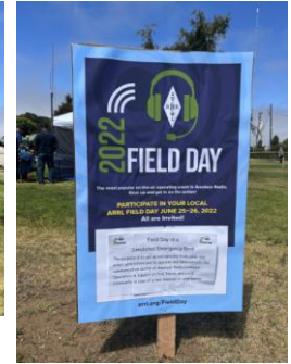
3 of the Official ARRL signs were posted at the Elm Street Park Field day location in Arroyo Grande, CA