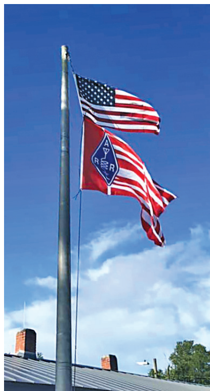
US and ARRL flags were prominently displayed at the 2021 ARRL Field Day location of the East Pasco Amateur Radio Society, K4EX. They set up their station at the San Antonio Railroad Depot Museum in San Antonio, Florida.

Newark Ohio ARA N8ARA 121 2 25 1,292 OH Elkhorn Valley ARC W0OFK 209 2 30 1,194 NE San Luis Valley ARA K0SLV (+NA0ED) 78 2 12 1,166 CO Jacksonville ARS K9JX 29 2 10 1,136 IL Central New York ARC N2CNY 119 2 4 1,088 WNY Saginaw Valley ARA K8DAC 104 2 12 1,080 MI Elmira ARC VE3ERC 178 2 5 1,014 ONS Lake Oswego ARES WA7LO 32 2 10 1,014 OR Kern Co. Central Valley ARC W6LIE 30 2 4 1,010 SJV Red River Valley ARC W4W 175 2 15 1,000 NTX Maxim Integrated Beaverton & Friends N7QJ 183 2 8 958 OR North Hills RC K6IS 185 2 25 860 SV Plano AR Klub K5PRK 93 2 9 846 NTX Grundy Co. ARC W9G (+KB9SZK) 18 2 6 806 IL Stillwater ARC (OK) K5SRC 44 2 12 760 OK Eastern Ozarks ARC K0EOR 46 2 5 234 MO Maple Ridge ARC VA7SGY 11 2 4 172 BC Peace Country ARC VE6ARC 58 2 4 166 AB