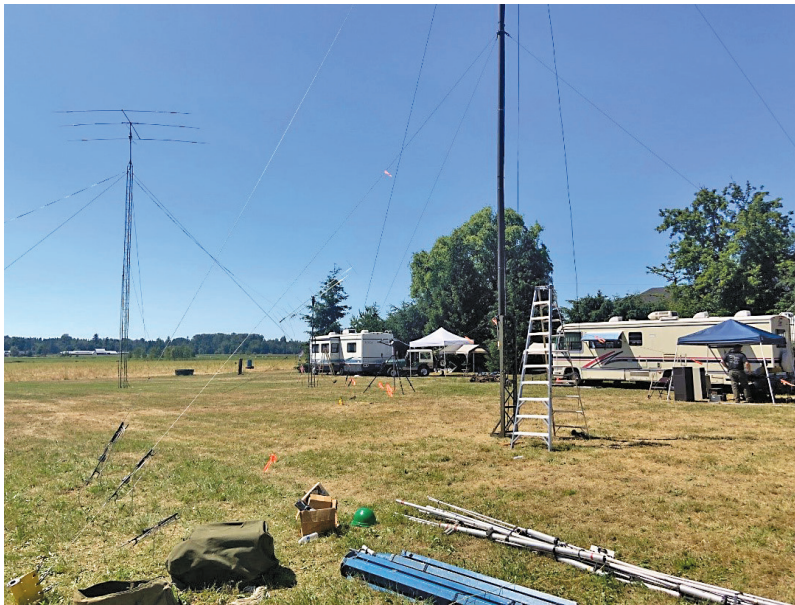
The antenna setup for the Whatcom Emergency Communications Group, W7ECG, at their location in Everson, Washington, during the 2021 ARRL Field Day.