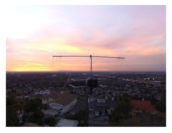
N6NB says this photo is about going off into the sunset, literally and perhaps figuratively