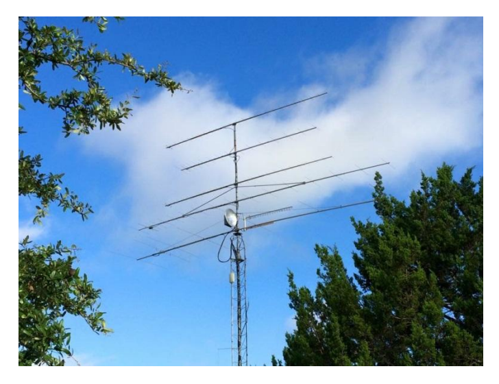
The impressive K5TR VHF/UHF antenna farm