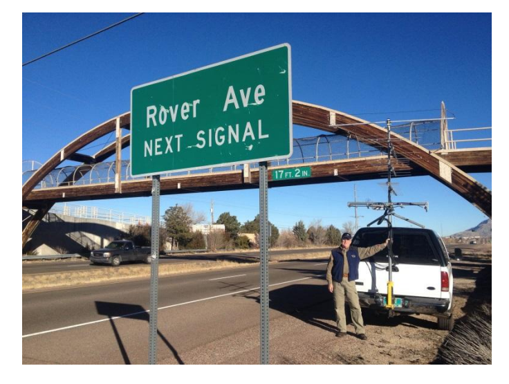
W7QQ/R discovered that the Rovers have their own road!

reassembly with a ladder but killed an hour messing with it and talking to him."