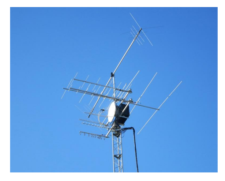
A better view of the N6NB antennas for 14 bands, 7 MHz through 10 GHz