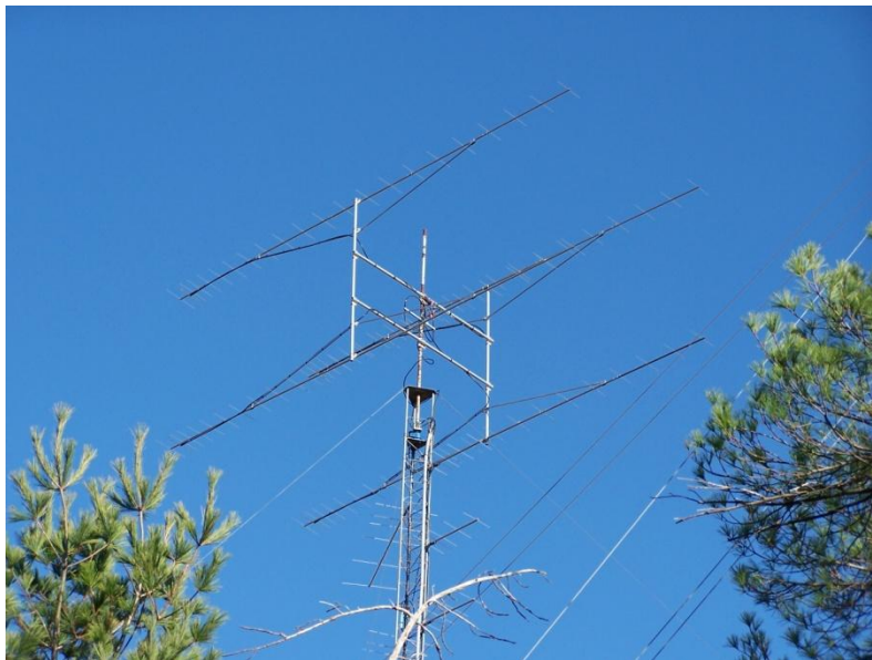
The new K1WHS 222 MHz quad-Yagi array consisting of four 28-ft long 22-element Yagis in an H-frame at 100 ft.

repeating in the 4 th position. They were followed by W2EA, N9UHF, K4EJQ, K3EOD and W4MYA. Rounding out the Top 10 stations was WY3P who made a lot of other contesters happy handing out relatively rare grid FM27.