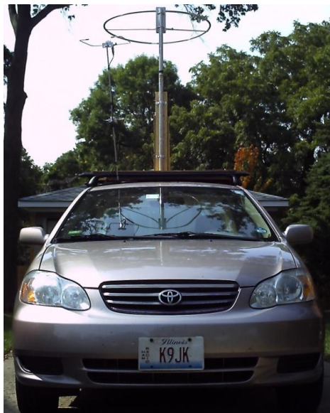
The well-equipped K9JK rover

Regionally, there were many fine efforts worth noting in the traditional Rover category including NN3Q who led the Northeast ahead of K2QO, KB1EKZ, WA2IID and W1AUV. In the Southeast AG4V and N4OFA