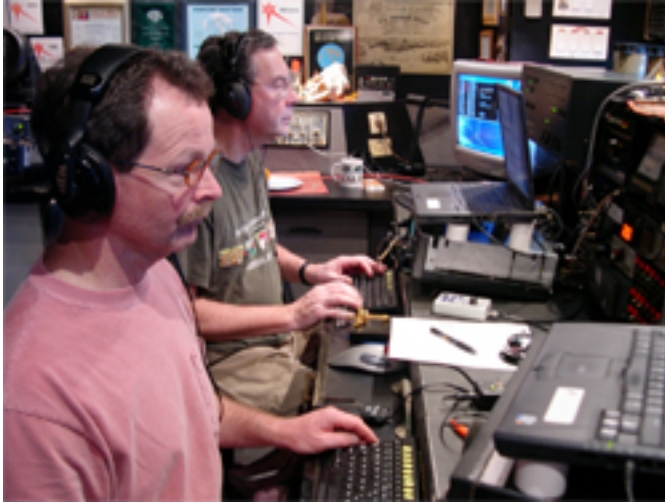
W4OC and N4GG in "full concentration" mode at HP1XX, where they finished in second place in the Multi-Two category.