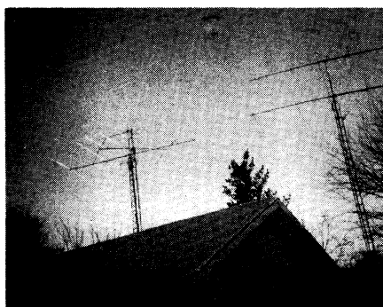
Jasen, KB9AAW/N, put these antennas to good use with a first-place finish in the IL Section.