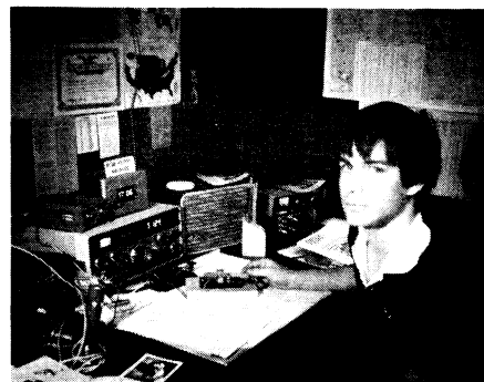
Southern New Jersey section leader WA2HXG pulled in 66 sections and 331 QSOs, giving Rob better than 21k.

the previous night's storm and was lying on the ground. (WB4WXA) Was glad to see many fellow Techs out there. (WB2GTP/T) In spite of my rotten luck, it was fun. (WB7FFJ) My most frustrating moment was answering a VP1's CQ on 80 meters — only to hear an S9 WB8 station come back calling CQ NR. (WB8VEF) I feel like I could handle anything that came along after '77 NR. (WB0SPL) [See you in the November SS. — Ed.] The greatest thing for improving cw proficiency I have come